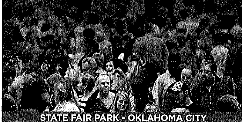
STATE FAIR PARK - OKLAHOMA CITY